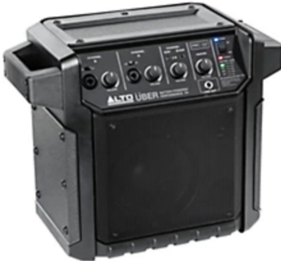
Alto Uber PA Wireless Portable Bluetooth Speaker

Bigger than a breadbox, but smaller than a dishwasher.