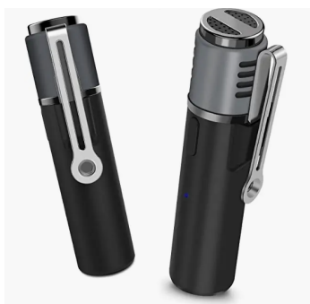
ZealSound Bluetooth Lavalier Microphone for Phone Computer, YouTube Video Recording, Noise Reduction, Vlogger and Blogger, View on Amazon

Having an inventory of different mics in a mobile bag is always helpful. Here are a few examples of the types of microphones. Some can be bluetooth, others may have to have a separate powerpack with a bluetooth receiver. Bluetooth and wireless are not the same, bluetooth is for close proximity to your phone. Wireless is when you want to place a microphone further away from where your phone would be located.