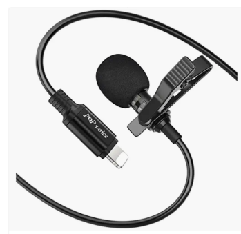
PoP voice Microphone Professional for iPhone Lavalier Lapel Omnidirectional Microphone for iPad, iPod, Condenser Mic for iPhone... View on Amazon 4.4 ★★★★★ (425)